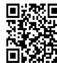
Two Rivers Donate QR Code