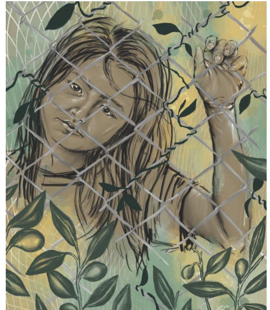
Release | Lisle Gwynn Garrity