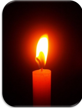
Yosefu Bazaniye January 1, 1940 — April 24, 2023