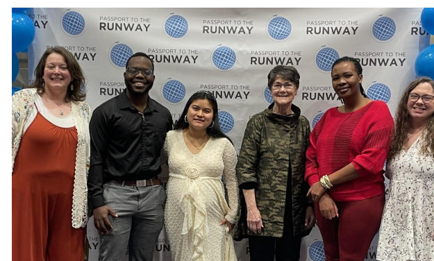
Two Rivers UMC table for the World Relief 'Passport to the Runway' Gala Fundraiser