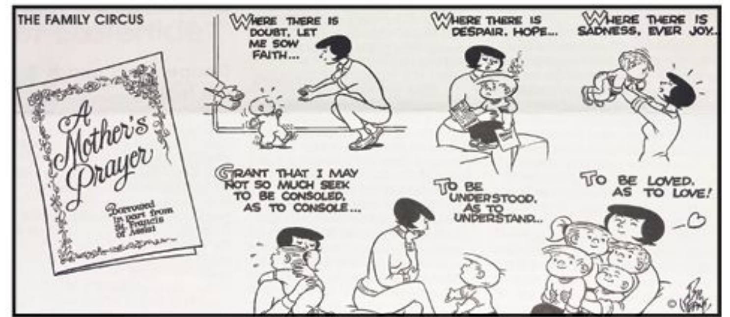
from JoyfulNoiseletter.com ©Bil Keane Reprinted with permission